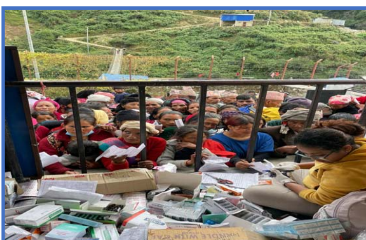
Free Health Camp at Gharanga Health Post