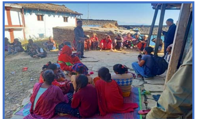
Psychological First Aid at Bheri, Jajarkot