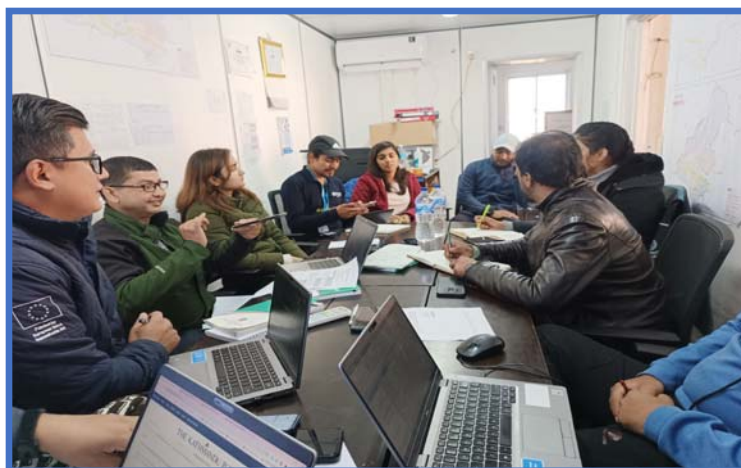
Interaction and coordination with EDCC team, PHSD and PHEOC