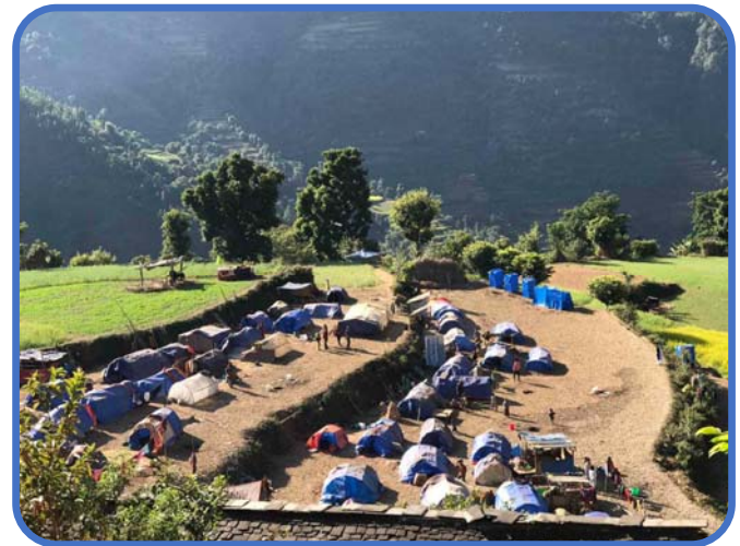
Displaced population of Nalgad ward 1, Jajarkot

On the night of November 3, 2023, a 6.4 magnitude earthquake struck the Karnali Province of Jajarkot and Rukum West district, with its epicenter located in Ramidanda, Jajarkot district, at 11:47 pm. Following the initial earthquake, numerous aftershocks occurred, causing fear among the local population. The ongoing aftershocks have compelled residents to evacuate their homes and seek to stay in open areas. A total of 18 local governments are affected where Jajarkot and Rukum West are severely affected in terms of human casualties, and damage to houses in Karnali Province.