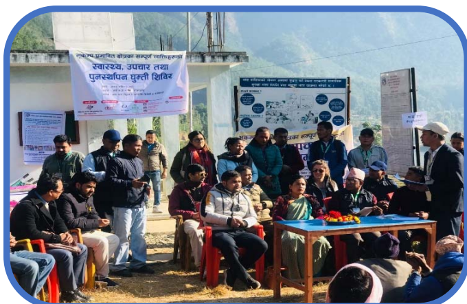
Health Treatment and Rehabilitation Mobile Camp Bheri municipality, Jajarkot