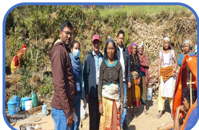
Water quality surveillance and sample collection is ongoing at community.