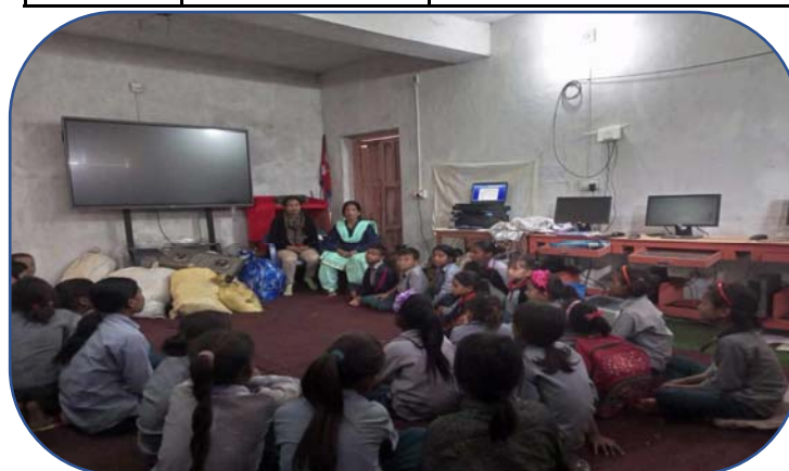
Psychological First Aid (PFA) for children at Bheri Municipality