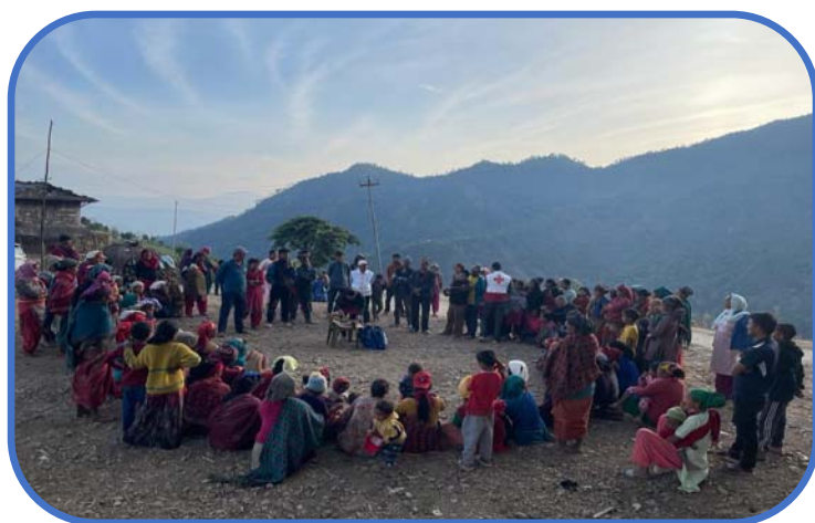
Psychosocial Counselling at Bhaunthan, Bheri Municipality