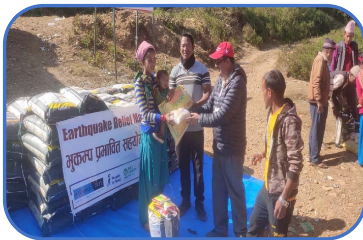
Relief materials distribution in ward no 6 of Bheri municipality Jajarkot