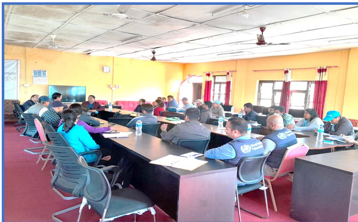
Regular Health and Nutrition Cluster Meeting as on 18-Nov-2023 at PHSD, Surkhet