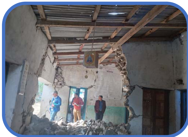
Chinabagar Health Post

A 6.4 magnitude earthquake struck the districts of Jajarkot and Rukum of Karnali province on 3rd November 2023 with Epi Center at Ramidanda, Barekot Rural municipality, Jajarkot district. The National Earthquake Monitoring and Research Center (NEMRC), a division of the Department of Mines and Geology (DMG), has documented a series of seismic events with epicenters located in the vicinity of Jajarkot District, which is situated within Karnali Province. The initial seismic activity associated with this earthquake was initially detected on November 3, 2023 (17-Kartik-2080).