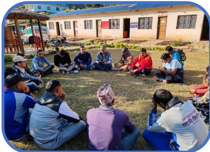
Monitoring team of MoSD visited at Darma Rural Municipality