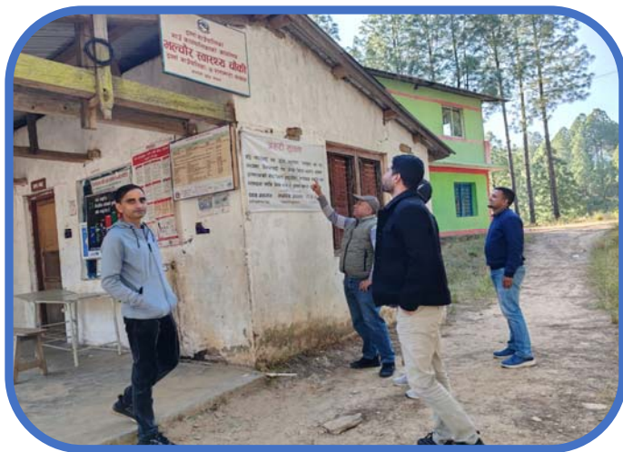
Information message about MHPSS and suicide prevention displayed at Bhalchaur Health Post