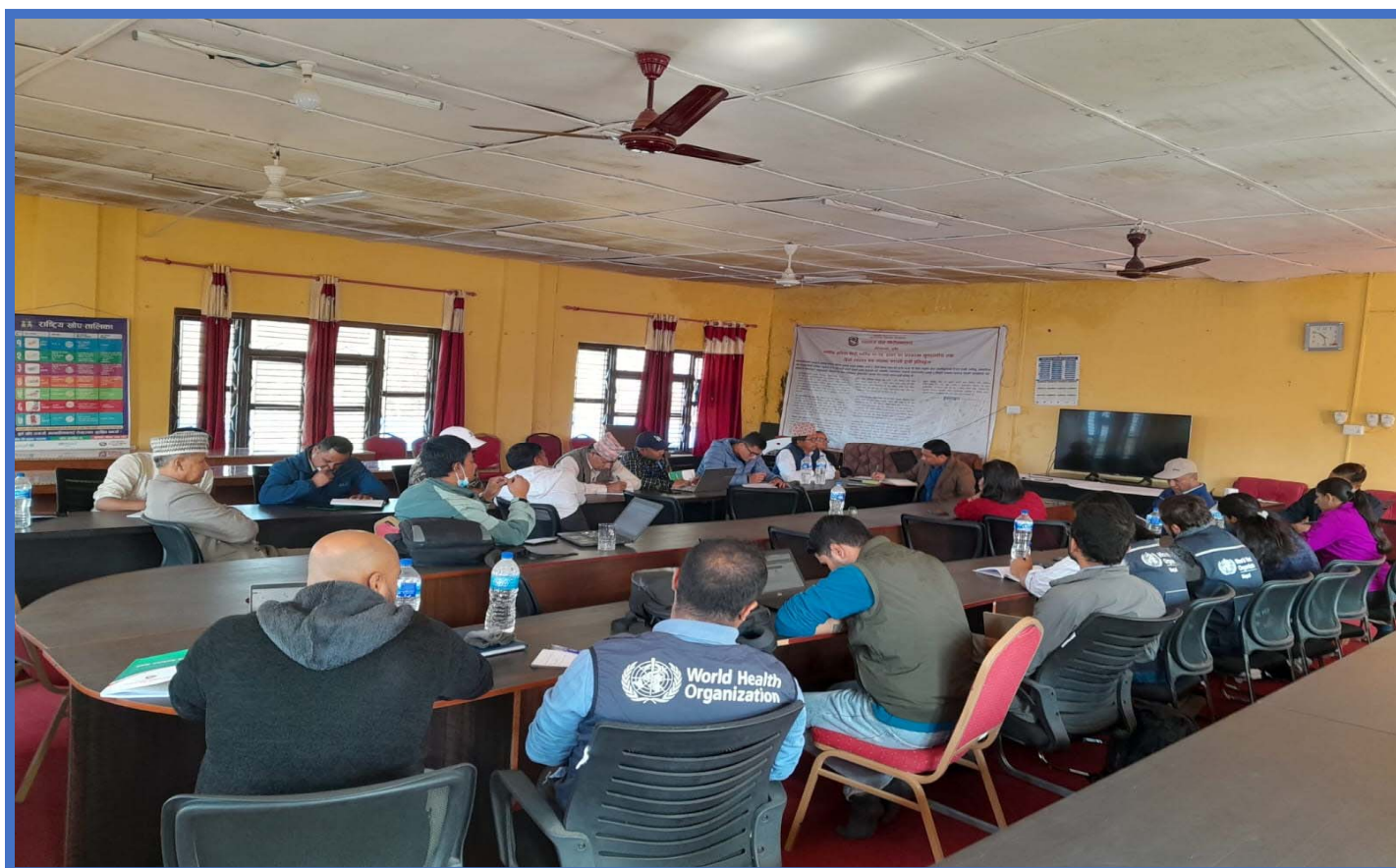
Regular Health and Nutrition Cluster Meeting as on 17-Nov-2023 at PHSD, Surkhet