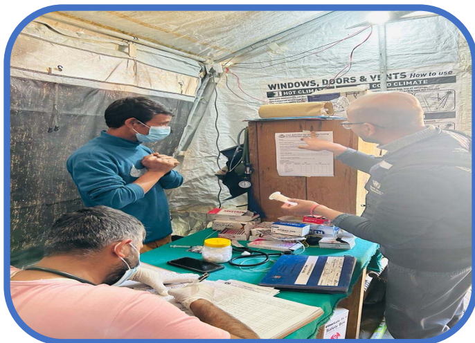
Active syndromic surveillance is ongoing