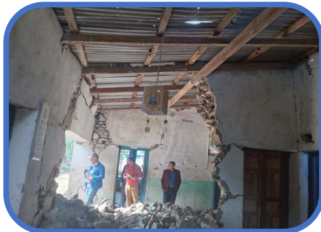
Chinabagar Health Post

A 6.4 magnitude earthquake struck the districts of Jajarkot and Rukum of Karnali province on 3rd November 2023 with Epi Center at Ramidanda, Barekot Rural municipality, Jajarkot district. The National Earthquake Monitoring and Research Center (NEMRC), a division of the Department of Mines and Geology (DMG), has documented a series of seismic events with epicenters located in the vicinity of Jajarkot District, which is situated within Karnali Province. The initial seismic activity associated with this earthquake was initially detected on November 3, 2023 (17-Kartik-2080).