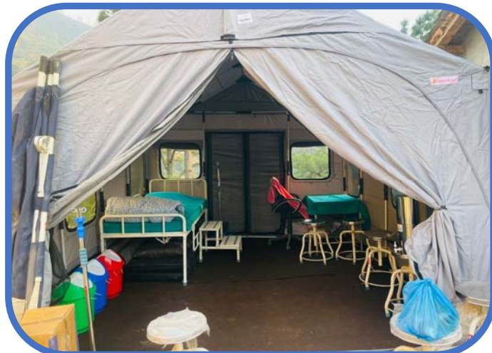
Equipment and tent support to Chinabagar to continue Basic Health Services