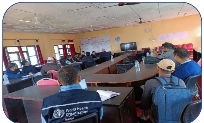
Health and Nutrition Cluster meeting as on 26-Nov-2023 at HSD, Surkhet