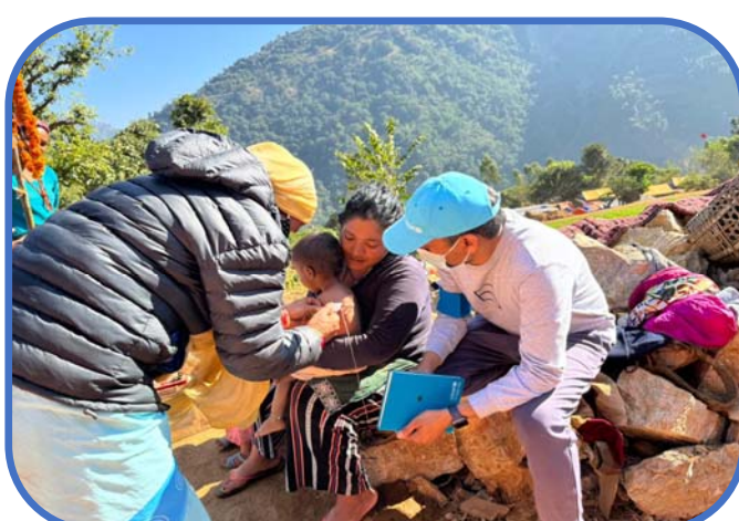
MUAC screening by FCHV at Nalgadh-1