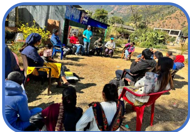
Meeting with all HF Incharge of Nalgad Municipality