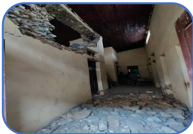
Limsa Hospital, Barekot Rural Municipality