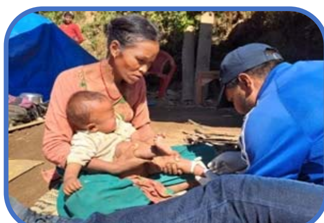
Fever with rash sample collection at Aathbiskot Municipality, Rukum West