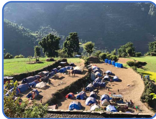
Displaced population of Nalgad ward 1, Jajarkot

On 3 Nov 2023 A 6.4 magnitude earthquake struck the districts of Jajarkot and Rukum of Karnali province with Epi Center at Ramidanda, Barekot Rural municipality, Jajarkot district. The National Earthquake Monitoring and Research Center (NEMRC), a division of the Department of Mines and Geology (DMG), has documented a series of seismic events with epicenters located in the vicinity of Jajarkot District, which is situated within Karnali Province. The initial seismic activity associated with this earthquake was initially detected on November 3, 2023 (17-Kartik-2080).