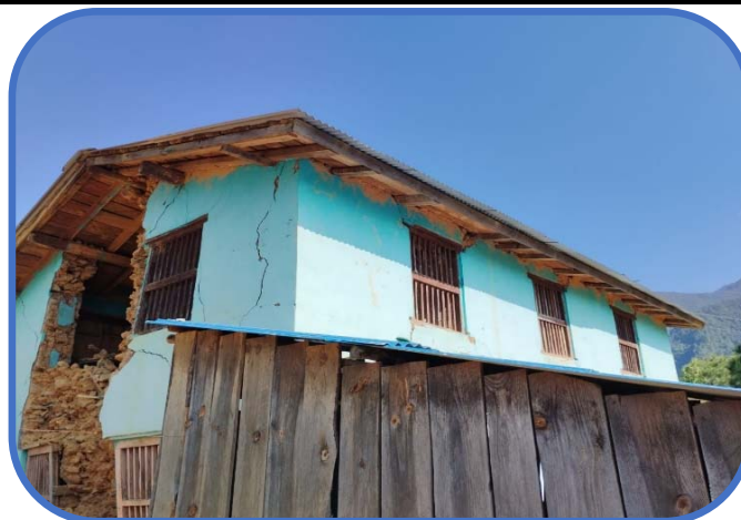
Ghetma Health Post, Aathbiskot Municipality14, Rukum West