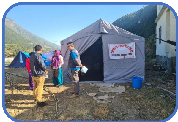
Chinabagar Health Post temporary setup