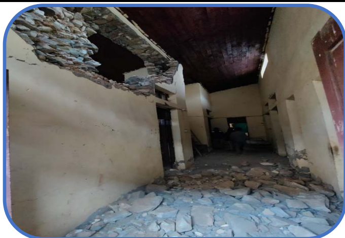
Limsa Hospital, Barekot Rural Municipality