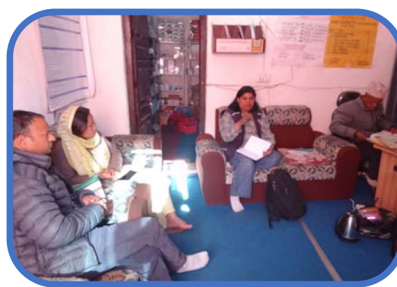
Health facilities and human resource mapping for MHPSS.