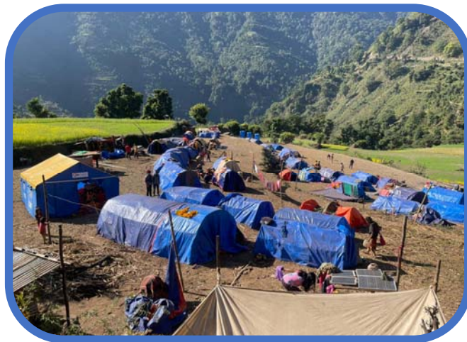
Displaced population of Nalgad ward 1, Jajarkot

A 6.4 magnitude earthquake struck the districts of Jajarkot and Rukum of Karnali province on 3rd November 2023 with Epi Center at Ramidanda, Barekot Rural municipality, Jajarkot district. The National Earthquake Monitoring and Research Center (NEMRC), a division of the Department of Mines and Geology (DMG), has documented a series of seismic events with epicenters located in the vicinity of Jajarkot District, which is situated within Karnali Province. The initial seismic activity associated with this earthquake was initially detected on November 3, 2023 (17-Kartik-2080).