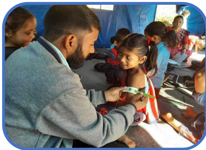
Nutritional Status Assessment, Darma, RM, Salyan