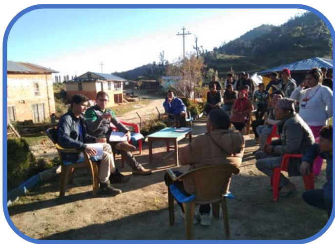
Coordination meeting with the community people and health care worker at Kuse RM, Jajarkot