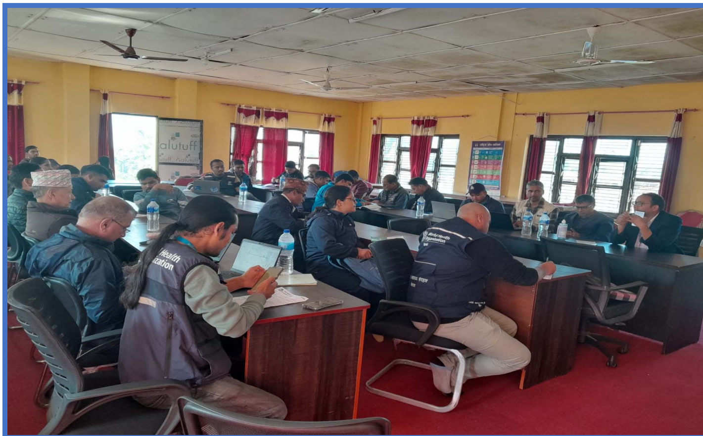
Regular Health and Nutrition Cluster Meeting as on 23-Nov-2023 at PHSD, Surkhet