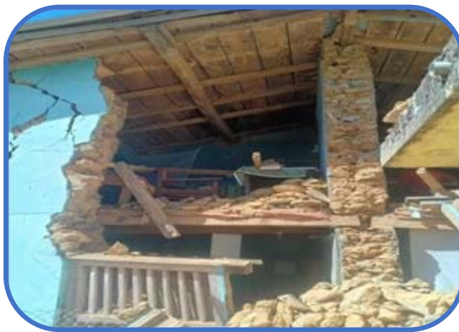
Ghetma Health Post, Aathbiskot Municipality14, Rukum West