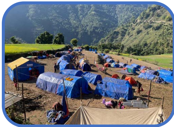
Displaced population of Nalgad ward 1, Jajarkot

A 6.4 magnitude earthquake struck the districts of Jajarkot and Rukum of Karnali province on 3rd November 2023 with Epi Center at Ramidanda, Barekot Rural municipality, Jajarkot district. The National Earthquake Monitoring and Research Center (NEMRC), a division of the Department of Mines and Geology (DMG), has documented a series of seismic events with epicenters located in the vicinity of Jajarkot District, which is situated within Karnali Province. The initial seismic activity associated with this earthquake was initially detected on November 3, 2023 (17-Kartik-2080).