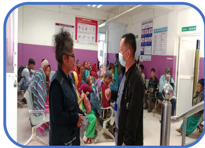
Ongoing Surveillance at Chaurjahari Hospital, Rukum West