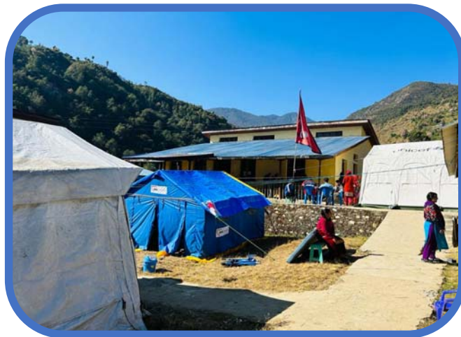
Limsa Basic Hospital, Barekot

A 6.4 magnitude earthquake struck the districts of Jajarkot and Rukum of Karnali province on 3rd November 2023 with Epi Center at Ramidanda, Barekot Rural municipality, Jajarkot district. The National Earthquake Monitoring and Research Center (NEMRC), a division of the Department of Mines and Geology (DMG), has documented a series of seismic events with epicenters located in the vicinity of Jajarkot District, which is situated within Karnali Province. The initial seismic activity associated with this earthquake was initially detected on November 3, 2023 (17-Kartik-2080).