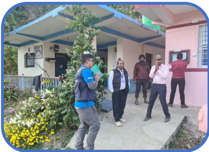
Field visit at Nalgad Municipality, ward no. 1 Chiure, Jajarkot