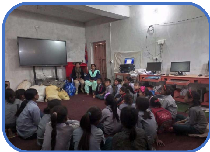
Psychological First Aid (PFA) with Rimna Children, Bheri Municipality, Jajarkot