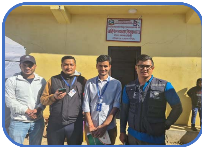
Field visit at Ghetma Health post, Aathbiskot Municipality, Rukum West