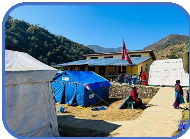
Limsa Basic Hospital, Barekot

A 6.4 magnitude earthquake struck the districts of Jajarkot and Rukum of Karnali province on 3rd November 2023 with Epi Center at Ramidanda, Barekot Rural municipality, Jajarkot district. The National Earthquake Monitoring and Research Center (NEMRC), a division of the Department of Mines and Geology (DMG), has documented a series of seismic events with epicenters located in the vicinity of Jajarkot District, which is situated within Karnali Province. The initial seismic activity associated with this earthquake was initially detected on November 3, 2023 (17-Kartik-2080).