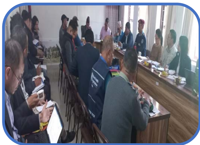
Inter-Cluster meeting Held in Surkhet at 20 Nov 2023 in MOIAL