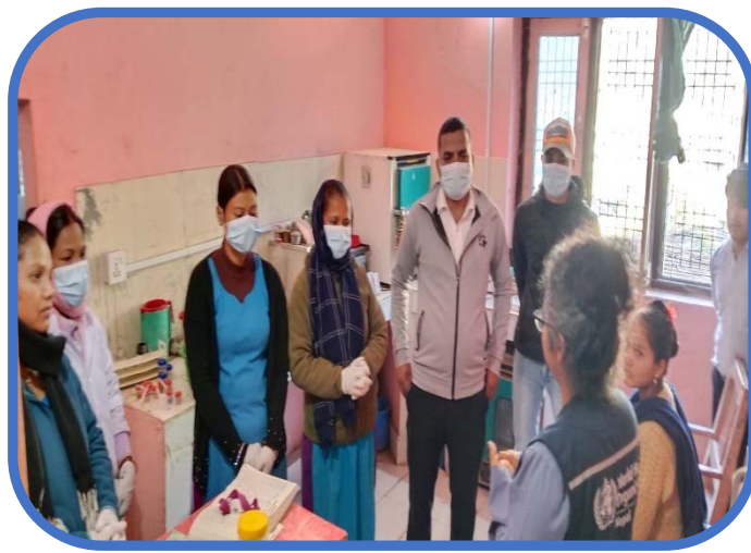
Active surveillance in West Rukum Health Facilities