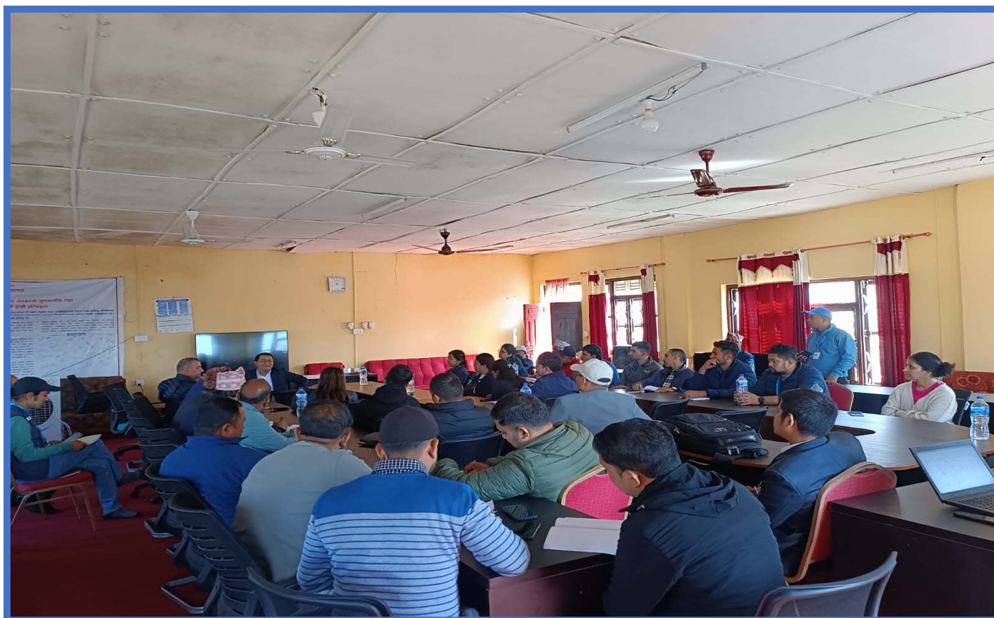
Regular Health and Nutrition Cluster Meeting as on 21-Nov-2023 at PHSD, Surkhet