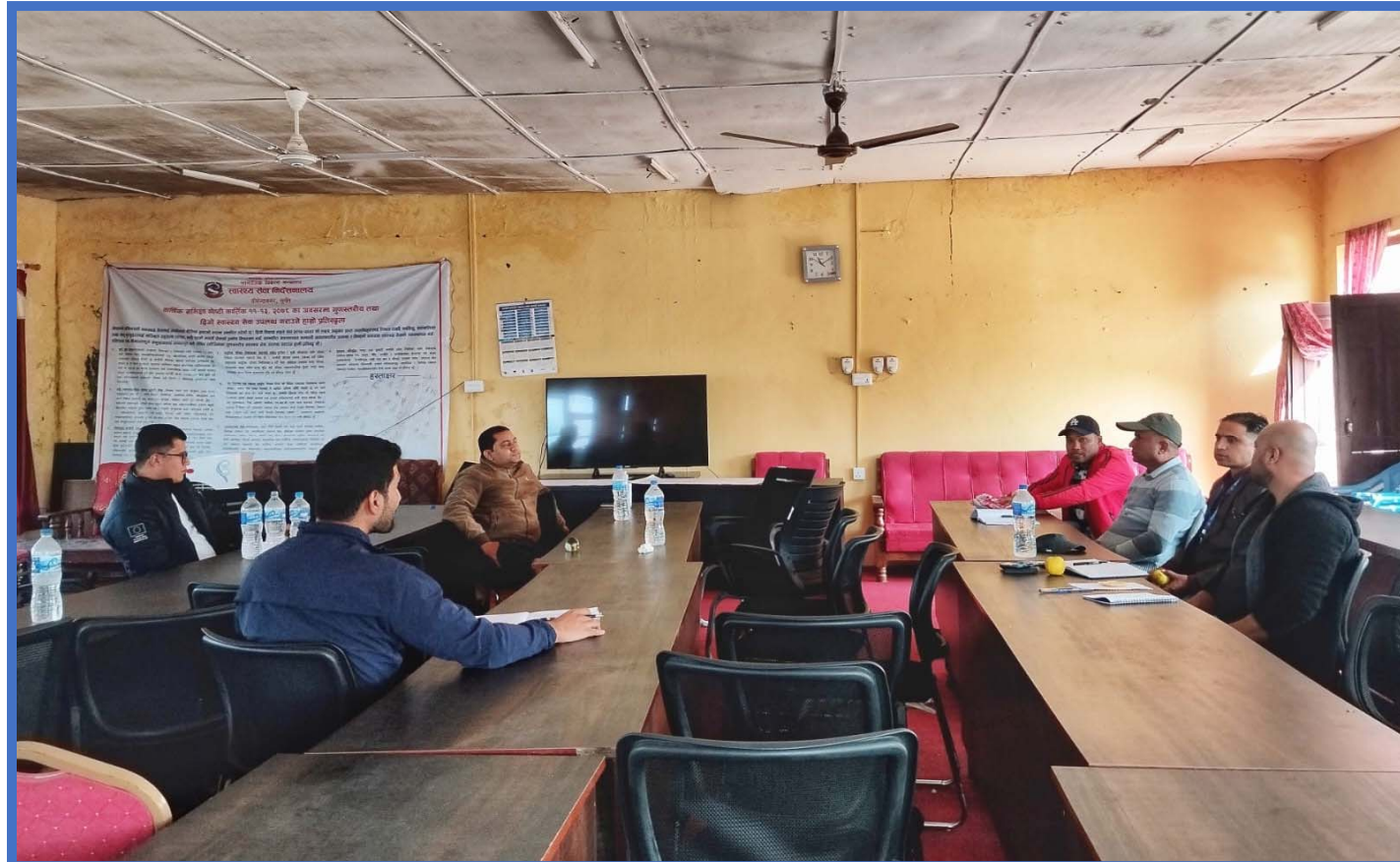
Regular Health and Nutrition Cluster Meeting as on 15-Nov-2023 at PHSD, Surkhet