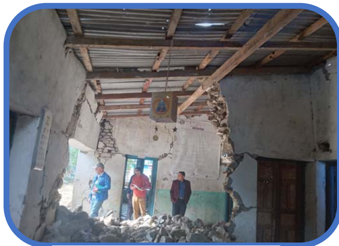
Chinabagar Health Post

A 6.4 magnitude earthquake struck the districts of Jajarkot and Rukum of Karnali province on 3rd November 2023 with Epi Center at lamidada, Barekot Rural municipality, Jajarkot district. The National Earthquake Monitoring and Research Center (NEMRC), a division of the Department of Mines and Geology (DMG), has documented a series of seismic events with epicenters located in the vicinity of Jajarkot District, which is situated within Karnali Province. The initial seismic activity associated with this earthquake was initially detected on November 3, 2023 (17-Kartik-2080).