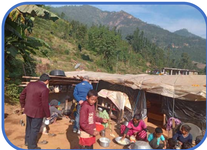
Monitoring visit on Rukum West