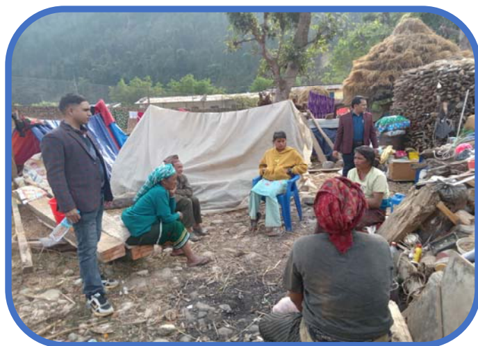
Earthquake affected area in Rukum District