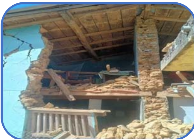
Ghetma Health Post, Aathbiskot Municipality14, Rukum West