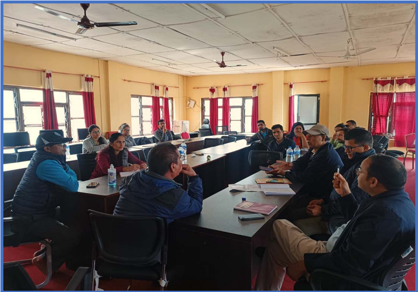
Regular Health and Nutrition Cluster Meeting as on 14-Nov-2023 at PHD, Surkhet