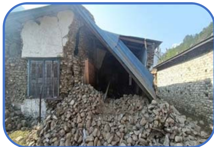
Chinabagar health post, Sanibheri RM -1, Rukum West