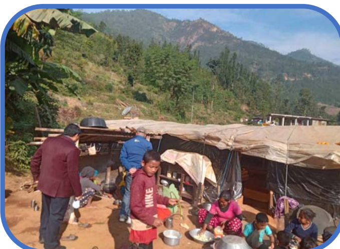
Monitoring visit on rukum West HSO.