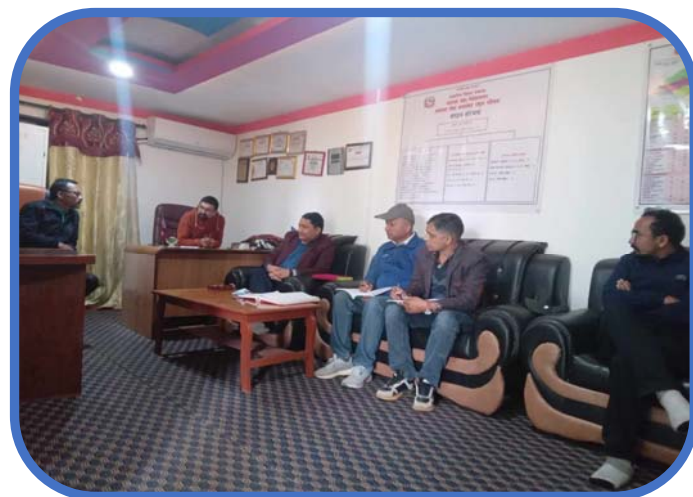
Monitoring from HSD Team on Rukum West earthquake affected region.